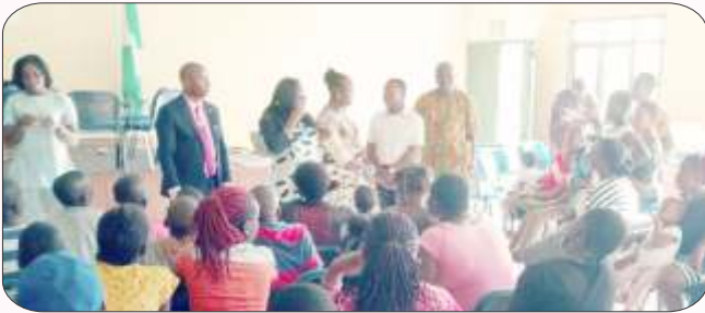
THE EXECUTIVE VICE CHAIRMAN OF OKIRIKA L.G.A ADDRESSING THE PARTICIPANTS IN OKIRIKA