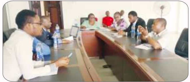
ADVOCACY TO THE EXECUTIVE VICE CHAIRMAN OF OKIRIKA L.G.A